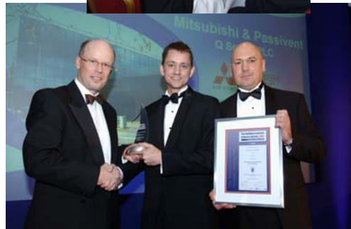
Mitsubishi collects Technical Innovation of the Year