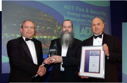
ADT Fire & Security Energy Savings