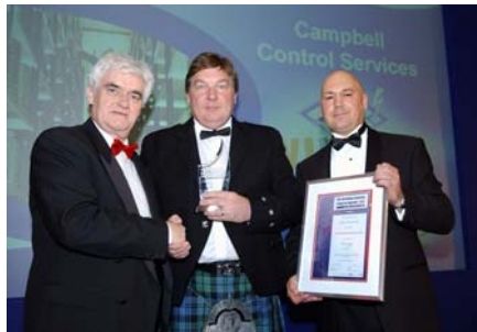
Campbell Control Services Systems Installer of the Year