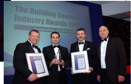
BMSi Best Service & Maintenance Provider